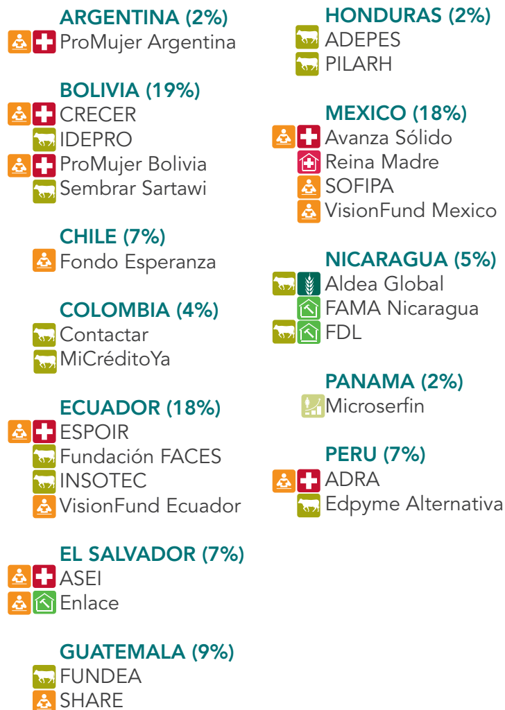
Percent of Current Loans Outstanding by Country

Note: All percentages have been rounded to the nearest whole number.